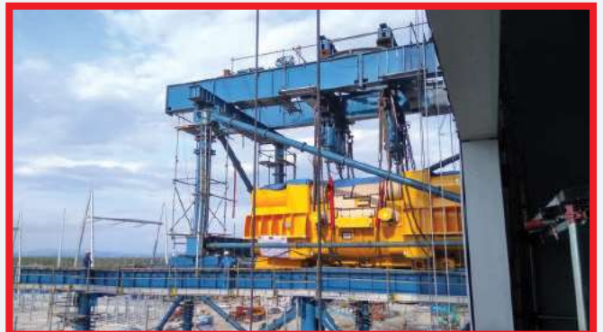
Cargo: Generator Stator Dimension: L10.95 m x W6.80 m x H5.47 m Weight: 462 ton Scope: Lifting, turning & positioning