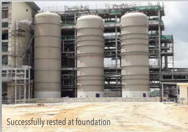
Successfully rested at foundation