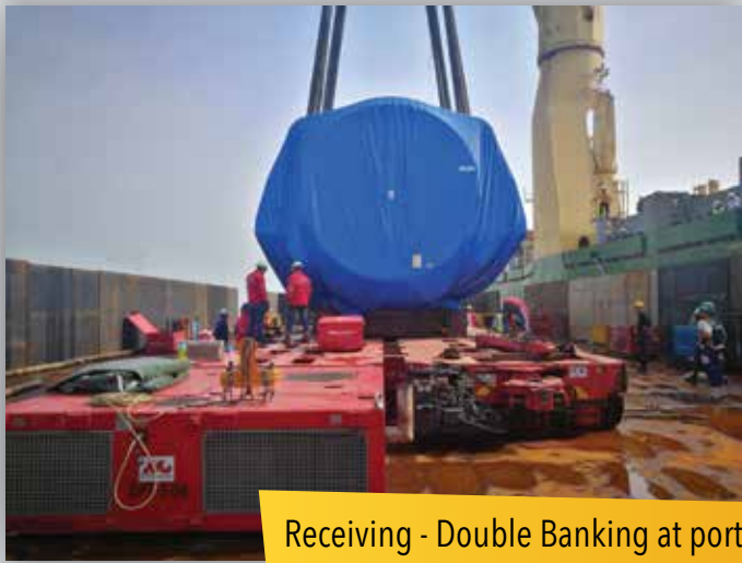
Receiving - Double Banking at port