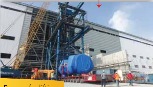
Prepare for lifting