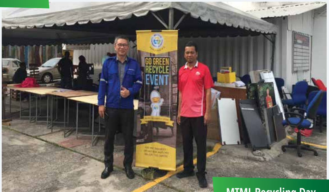
MTML Recycling Day