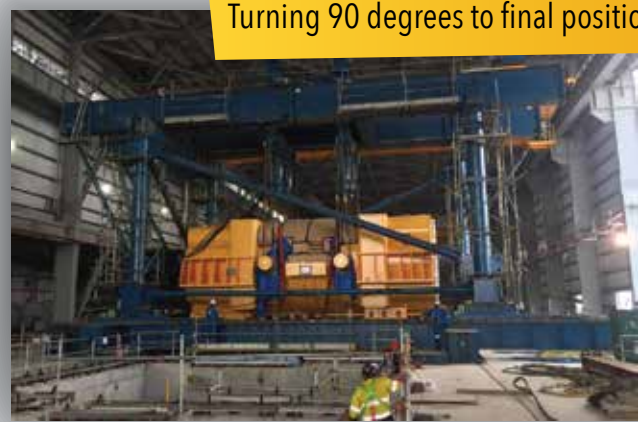
Turning 90 degrees to final position