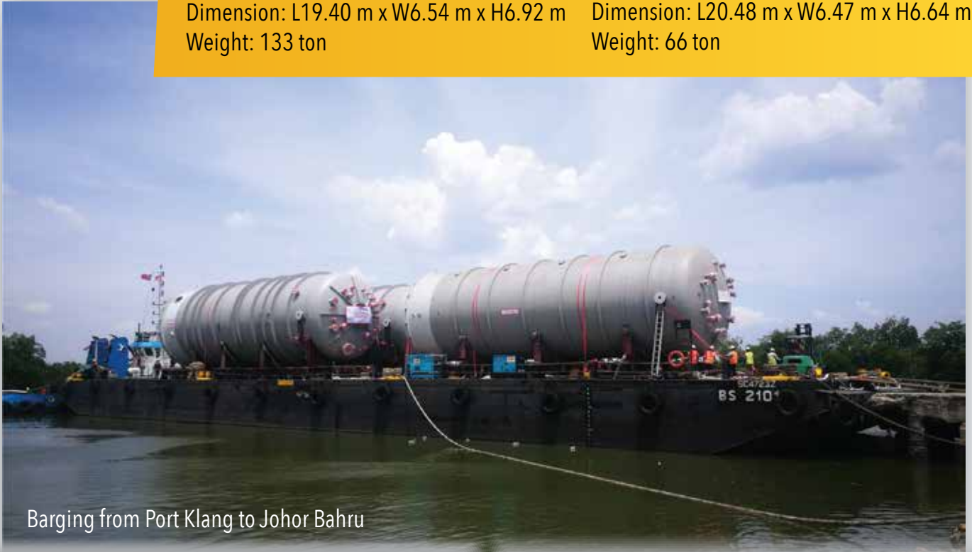
Barging from Port Klang to Johor Bahru

Cargo 2: Broth Tank (1 unit) Dimension: L20.48 m x W6.47 m x H6.64 m Weight: 66 ton