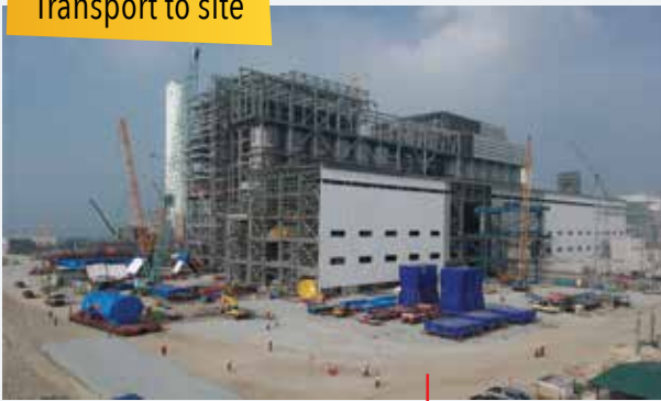
Transport to site