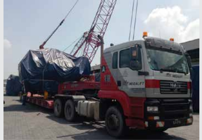
Scope: Transport Cargo: Parts of TBM range from 15 ton to 175 ton