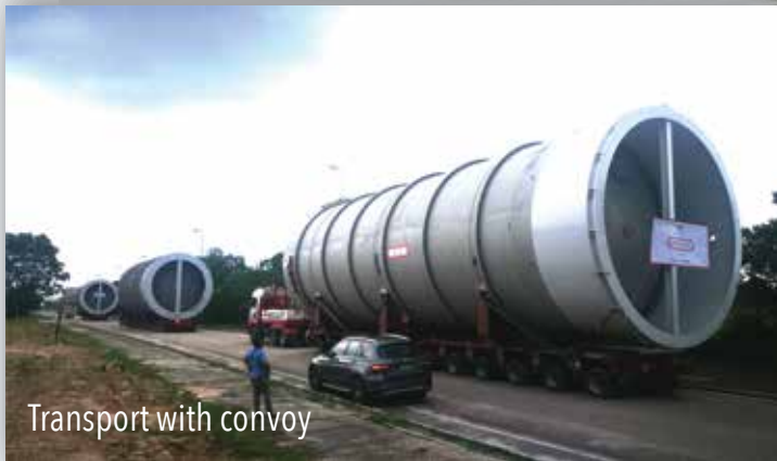
Transport with convoy