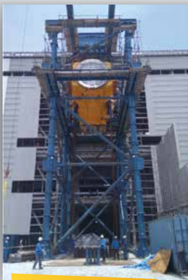
Lifting by Strandjack

Cargo: Generator Stator Dimension: L10.95 m x W6.80 m x H5.47 m Weight: 462 ton Scope: Double banking, RORO, barging, lifting and positioning