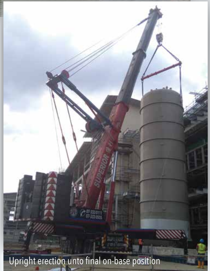
Upright erection unto final on-base position