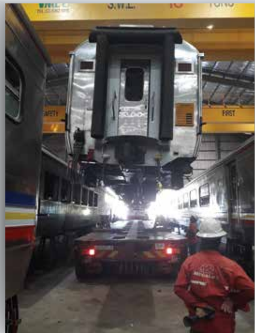
Scope: Transport Cargo: Coaches (5 units) Dimension: L21.00 m x W2.43 m x H2.74 m Weight: 25 ton