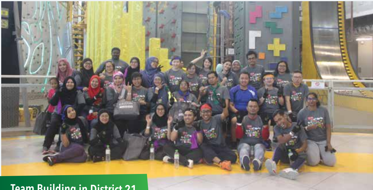
Team Building in District 21