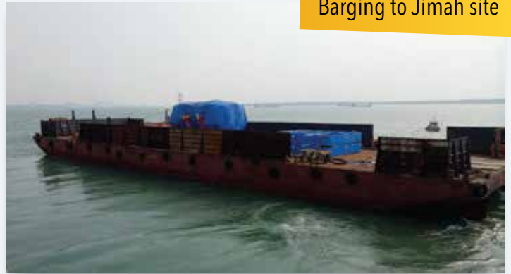
Barging to Jimah site