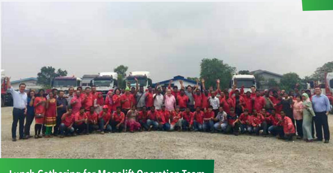
Lunch Gathering for Megalift Operation Team