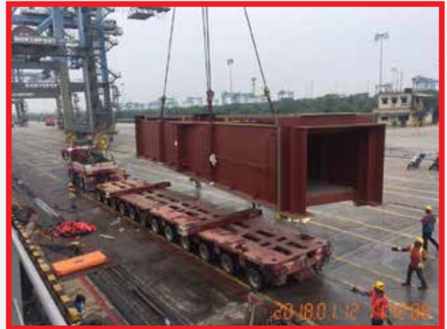
Dimension: L18.40 m x W3.75 m x H3.00 m Weight: 71 ton