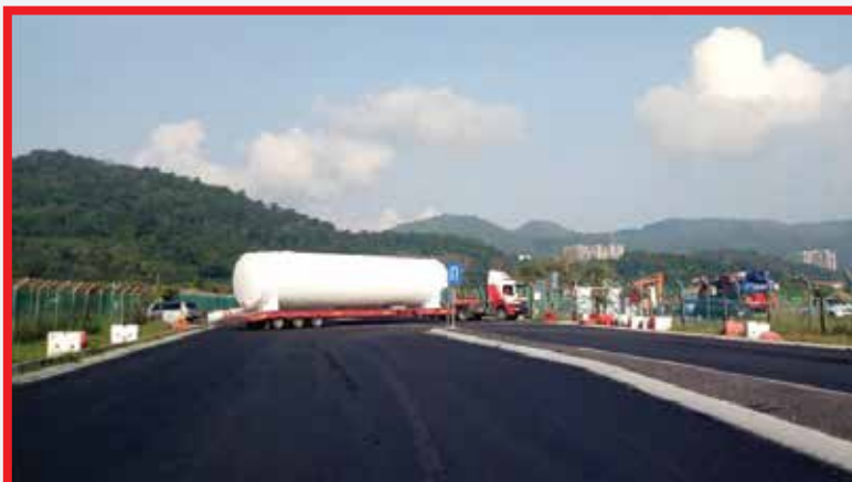
Cargo: 6 units of tanks Dimension: L15.00 m x W3.95 m x H3.95 m Weight: 18 ton Scope: Transportation