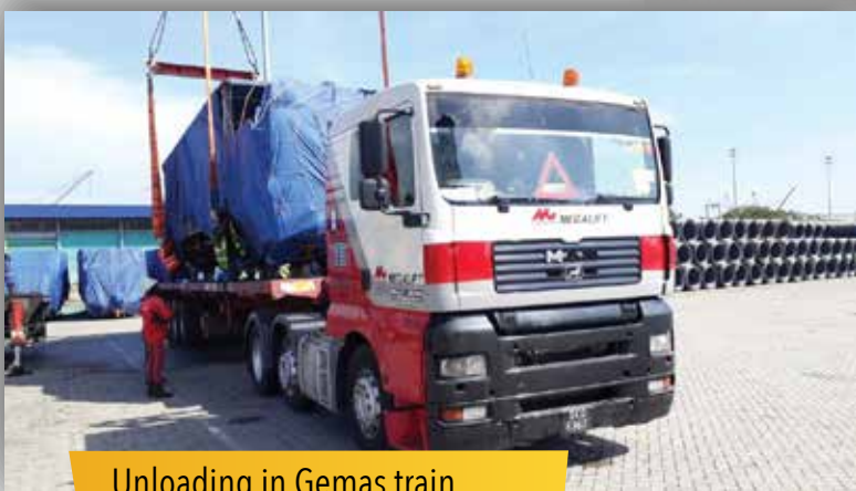
Unloading in Gemas train station

Scope: Transport from manufacturer's site to Shanghai port, freighting from Shanghai to Port Klang, and delivery to Gemas