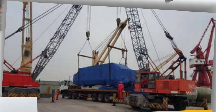
Delivery from manufacturer to Shanghai port