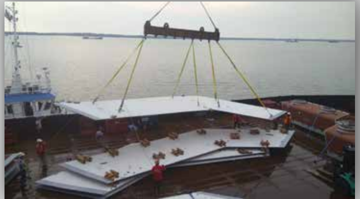
Scope: Double banking in Port Klang, barging and transport to site Cargo: Panel structures of various sizes, shapes and weights