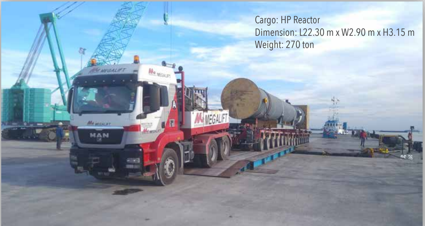
Cargo: HP Reactor Dimension: L22.30 m x W2.90 m x H3.15 m Weight: 270 ton

We have recently embarked on Rapid Package 29 project, also known as Isononanol (INA) Plant in Pengerang, Johor which is expected to come on-stream by the second half of 2019.