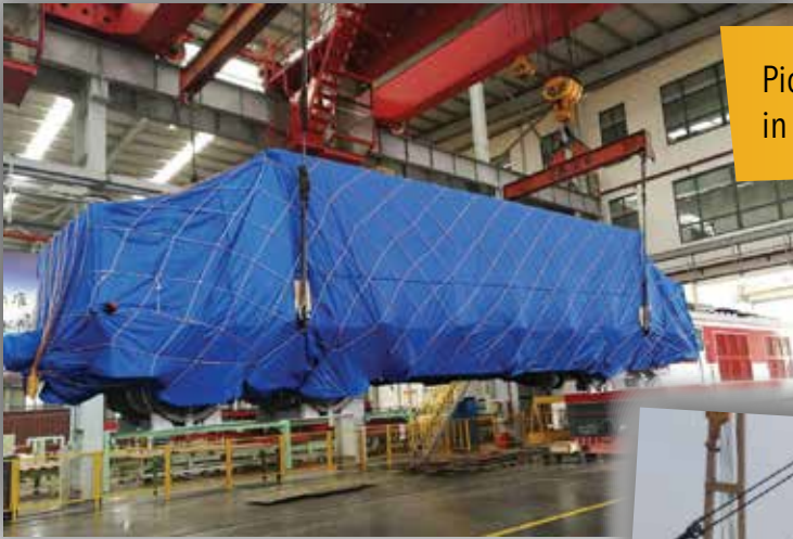
Picking up from manufacturer in Shanghai, China