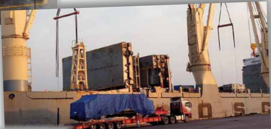
Discharging from vessel and loaded for delivery