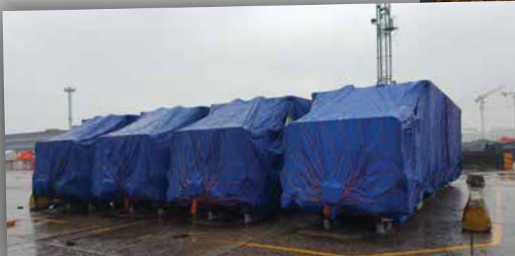
Waiting to be loaded onto vessel in Shanghai port