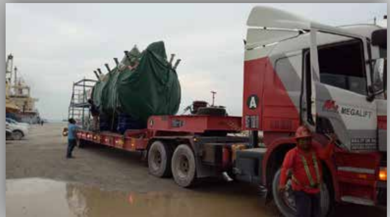
Cargo: Gas Compressor Unit Dimension: L11.60 m x W5.80 m x H6.40 m Weight: 67.00 ton