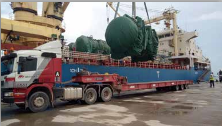
Cargo: Gas Compressor Unit Dimension: L9.70 m x W4.90 m x H6.40 m Weight: 44.15 ton