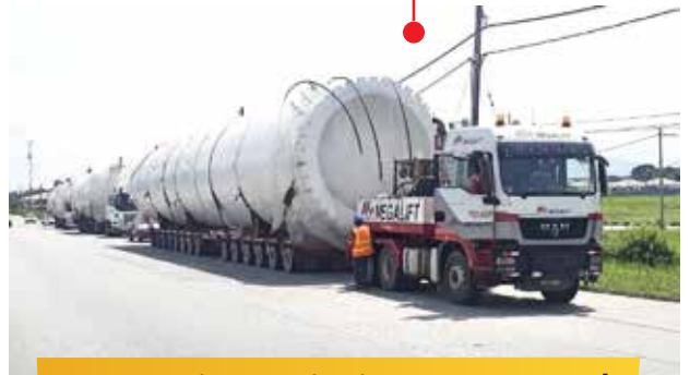
Transporting to site in Gopeng, Perak