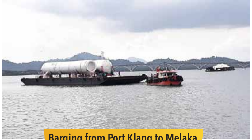
Barging from Port Klang to Melaka