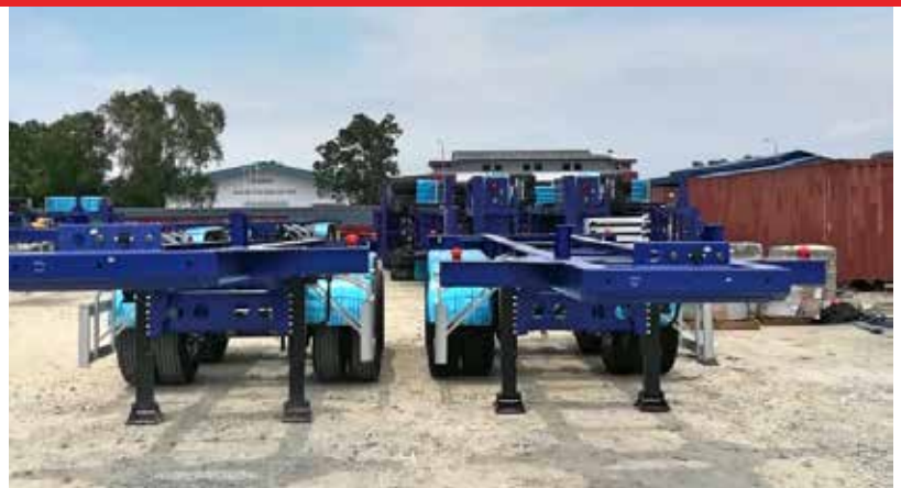
These chassis are unstuffed from containers and stored at our yard in Port Klang. We also assist in installation works and the inspections by the Road Transport Department of Malaysia prior to transferring the trailers to our client.