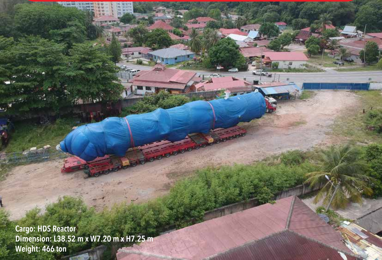
Cargo: HDS Reactor Dimension: L38.52 m x W7.20 m x H7.25 m Weight: 466 ton

Melaka Refinery Diesel Euro 5 is a new project situated in Melaka to increase the production of Euro 5 diesel for domestic consumption. Megalift is proud to be the appointed project logistics partner to move all small and oversized cargoes in Malaysia. In the recent major shipments, we transported the Reactor Feed, HDS Reactor, Salt Dryers, Shift Converters and many other smaller items.