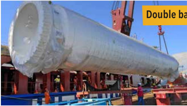
Double banking at Port Klang