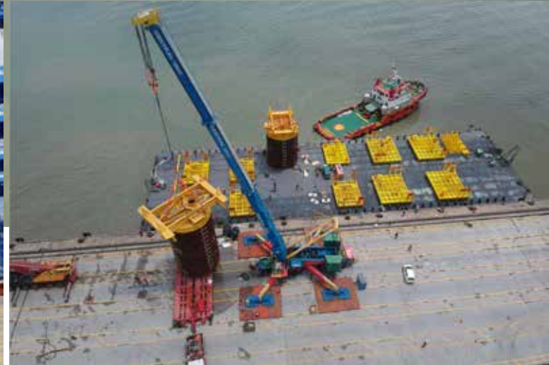
Cargo 1: Hub Manifold Suction Anchor Dimension: L7.50 m x W7.50 m x H16.40 m Weight: 96 ton