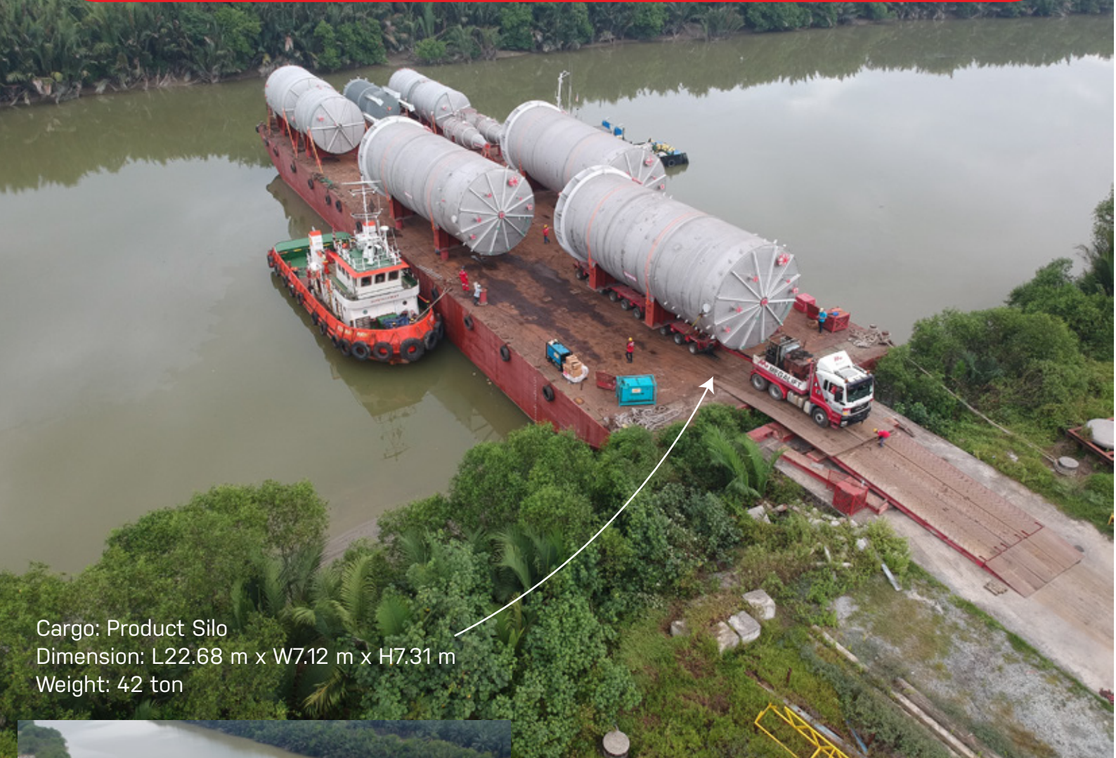
Cargo: Product Silo Dimension: L22.68 m x W7.12 m x H7.31 m Weight: 42 ton