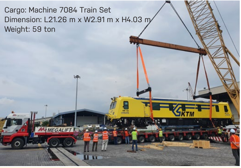
Received the Machine Train Set in Port Klang that was shipped via RORO vessel from Germany. We then transported to Shah Alam and offloaded using two sets of mobile cranes.